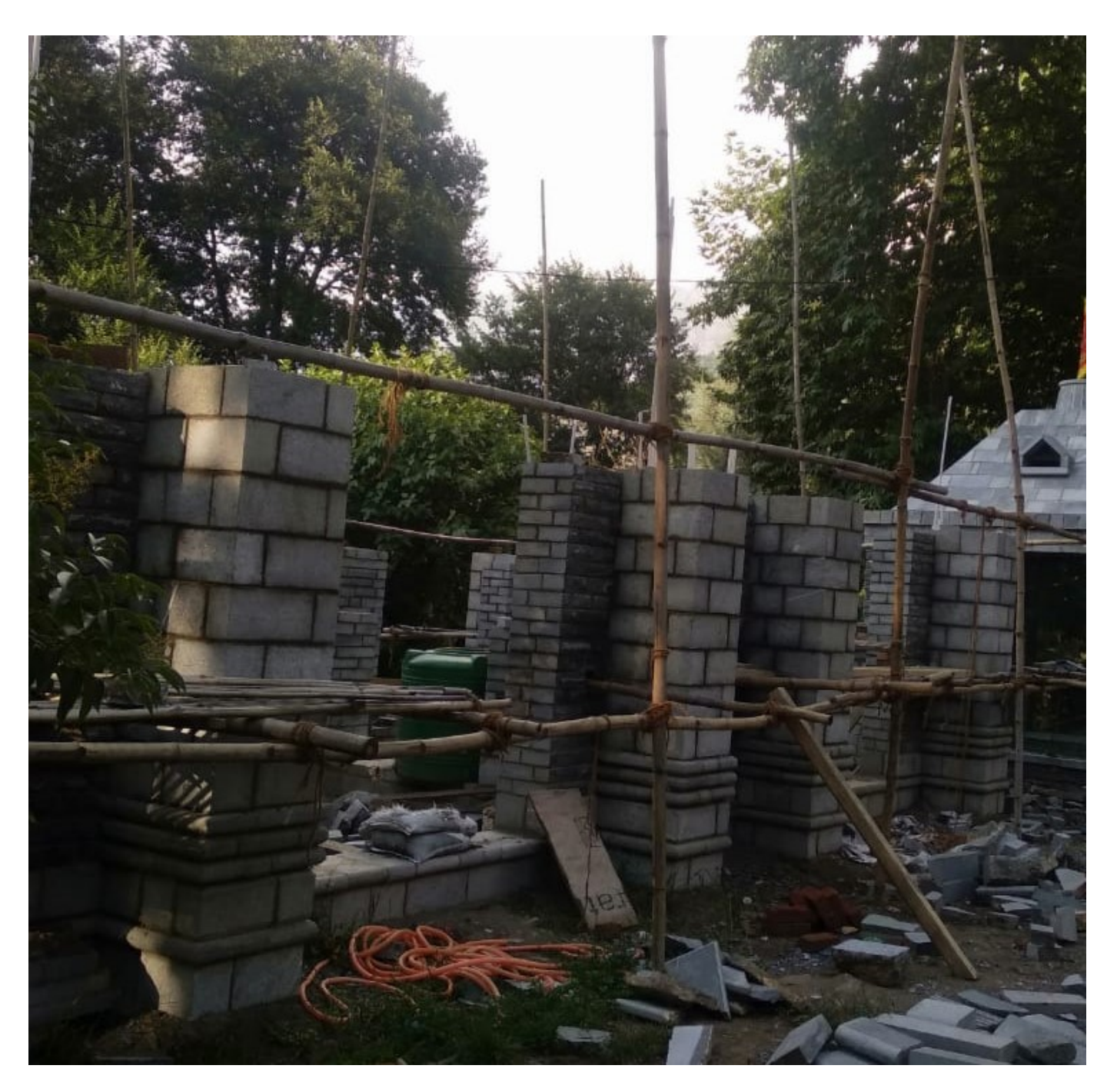
Hermitage and Shivaliya under construction