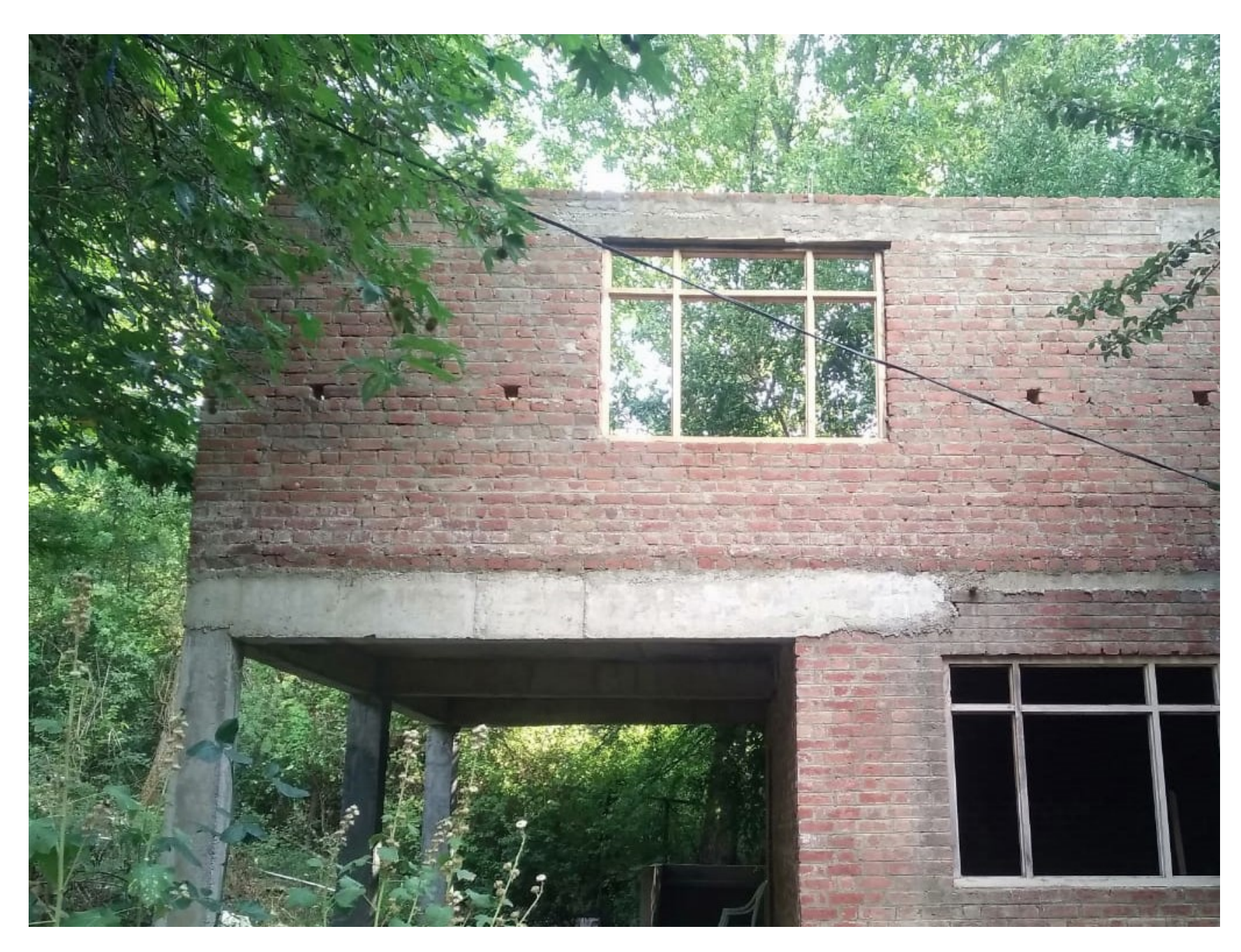
Rehas Updesh Research Cum Meditation Centre